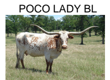
POCO LADY BL