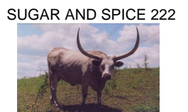
SUGAR AND SPICE 222