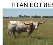
TITAN EOT 8E8