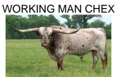
WORKING MAN CHEX